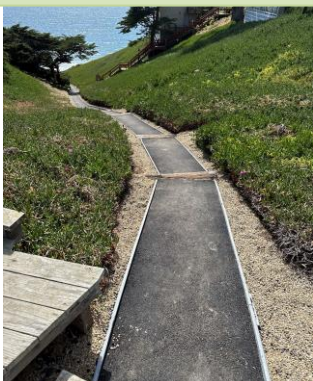
Our New Path to the Beach!

THANK YOU TO ALL WHO CONTRIBUTED TO THE REPAIR OF OUR PATH TO THE BEACH!!